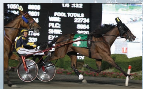
CHINA PEARLS 2011 SBOA Filly Stakes Winner (Trot)