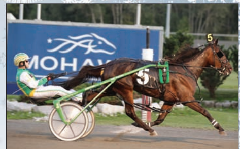
MONKEY ON MY WHEEL 2011 SBOA Filly Stakes Winner (Pace)

Standardbred Breeders of Ontario Association