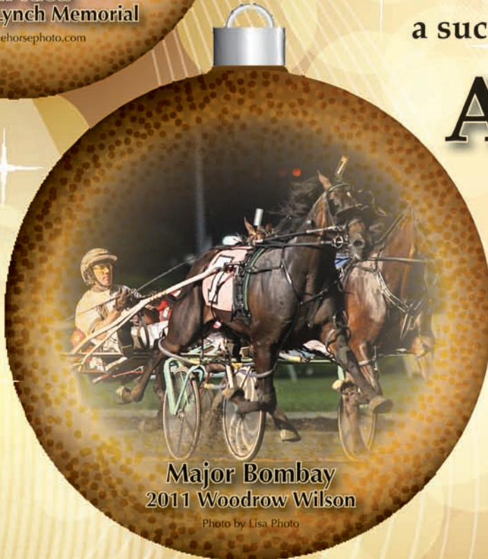
Major Bombay 2011 Woodrow Wilson