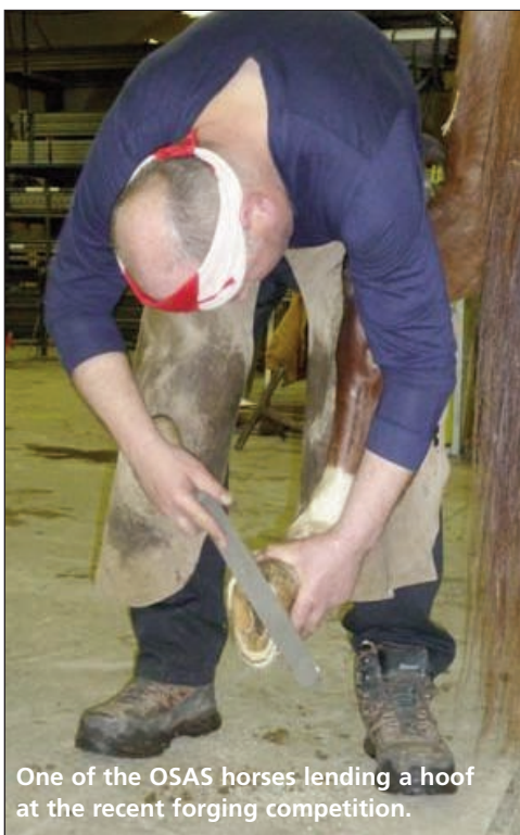
One of the OSAS horses lending a hoof at the recent forging competition.

Note: The Harness Edge has not tested, nor does it endorse the products/services advertised within.